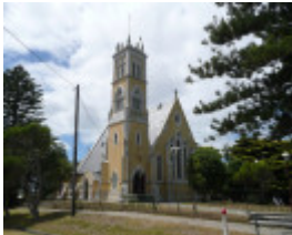
ST GEORGE THE MARTYR CHURCH AND PARISH HALL SOHE 2008