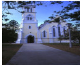
1 st george the martyr church & parish hall hobson street queenscliff front view