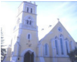
h01125 st george the martyr church and hall hobson st queenscliffe south face she project 2003