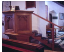
h01125 st george the martyr church and hall hobson st queenscliffe pulpit she project 2003