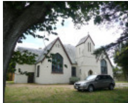
ST GEORGE THE MARTYR CHURCH AND PARISH HALL SOHE 2008