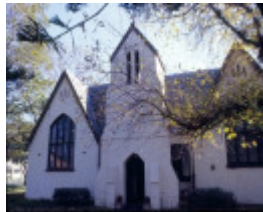
h01125 st george the martyr church and hall hobson st queenscliffe facade school hall she project 2003