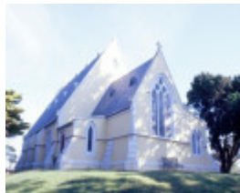
h01125 st george the martyr church and hall hobson st queenscliffe west wall she project 2003