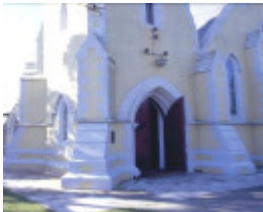
h01125 st george the martyr church and hall hobson st queenscliffe buttresses she project 2003