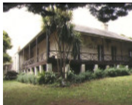
1 warringah mercer street queenscliff front view oct1995