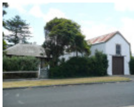
WARRINGAH SOHE 2008