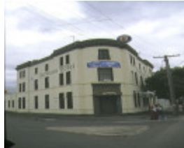
1 terminus hotel geelong front corner view apr1997