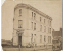
Terminus Hotel, c.1861, SLV, acc H13864.jpg