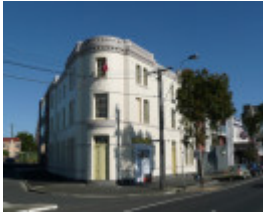
TERMINUS HOTEL SOHE 2008