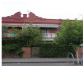
DOROTHY TERRACE SOHE 2008