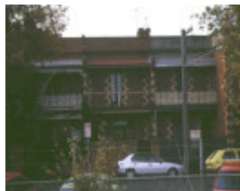
H1037 1 dorothy terrace 36 lulie street abbotsford front view