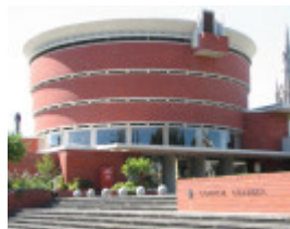
BRIGHTON MUNICIPAL OFFICES SOHE 2008