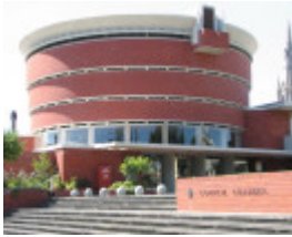
BRIGHTON MUNICIPAL OFFICES SOHE 2008