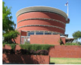
BRIGHTON MUNICIPAL OFFICES SOHE 2008