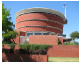
BRIGHTON MUNICIPAL OFFICES SOHE 2008