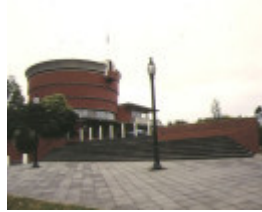
1 brighton municipal offices side view