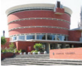
BRIGHTON MUNICIPAL OFFICES SOHE 2008