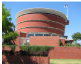
BRIGHTON MUNICIPAL OFFICES SOHE 2008