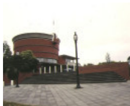
1 brighton municipal offices side view