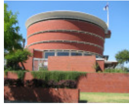
BRIGHTON MUNICIPAL OFFICES SOHE 2008