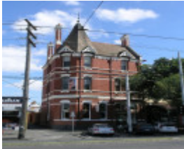
ANZ BANK SOHE 2008