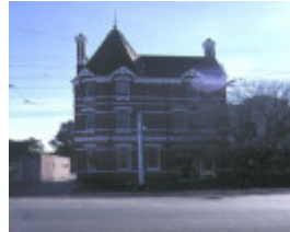
anz bank queens parade fitzroy north front view jul1986