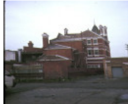
anz bank queens parade fitzroy north rear view 1989