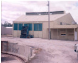
h01093 locodepot ararat march95