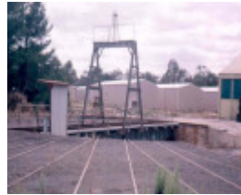
h01093 turntable ararat march95