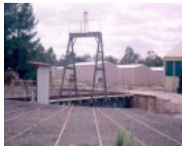
h01093 turntable ararat march95