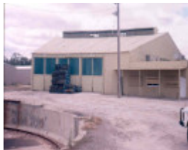
h01093 locodepot ararat march95