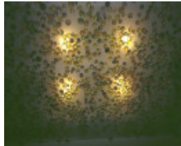
Delbridge House Eaglemont Lights 1995