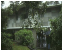
Delbridge House Eaglemont Rear View 1995