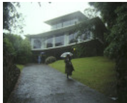
Delbridge House Eaglemont Exterior 1995