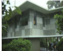
Delbridge House Eaglemont Rear View 1995