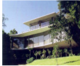
1 delbridge house frontview 1999