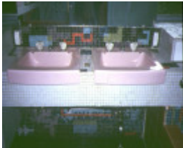
Delbridge House Eaglemont Bathroom 1995