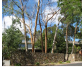
THE DELBRIDGE HOUSE SOHE 2008