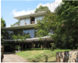
THE DELBRIDGE HOUSE SOHE 2008