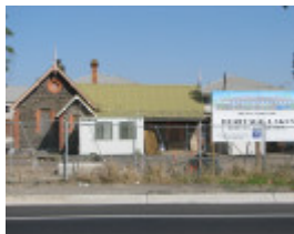
PRIMARY SCHOOL NO. 1975 SOHE 2008