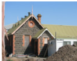
PRIMARY SCHOOL NO. 1975 SOHE 2008