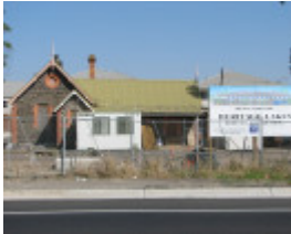
PRIMARY SCHOOL NO. 1975 SOHE 2008