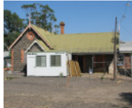
PRIMARY SCHOOL NO. 1975 SOHE 2008