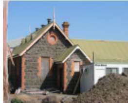
PRIMARY SCHOOL NO. 1975 SOHE 2008