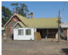
PRIMARY SCHOOL NO. 1975 SOHE 2008