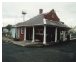
H01098 rafa barracks guard room 1995