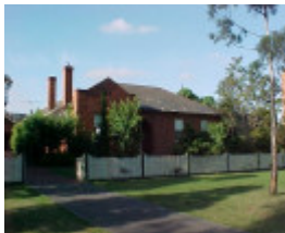
Rafa Barracks 3 Ordnance Reserve