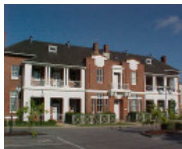
h01098 1 rafa barracks 2001