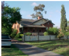
Rafa Barracks 2 Ordnance Reserve