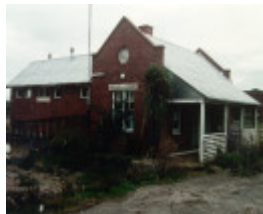
H01098 rafa barracks horse hospital demolished 1995