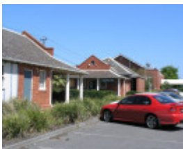
FORMER ROYAL AUSTRALIAN FIELD ARTILLERY BARRACKS SOHE 2008