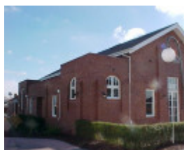
H01098 rafa barracks gymnasium 2001 pm1