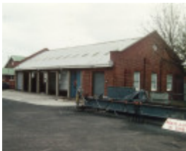
H01098 rafa barracks gun shed 1995