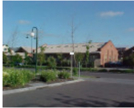
H01098 rafa barracks gun shed 2001pm1