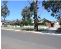
FORMER ROYAL AUSTRALIAN FIELD ARTILLERY BARRACKS SOHE 2008