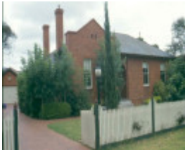
h01098 rafa barracks single men s quarters 2002