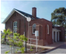
H01098 rafa barracks qstore infirmary 2001 pm1