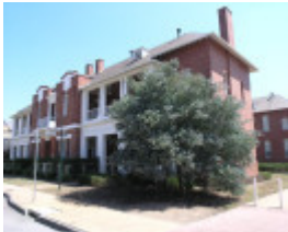
FORMER ROYAL AUSTRALIAN FIELD ARTILLERY BARRACKS SOHE 2008