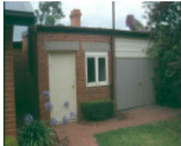
h01098 rafa barracks captain s quarters outhouse 2002