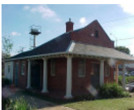
H01098 rafa barracks guard room 2001 pm1