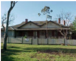
Rafa Barracks 1 Ordnance Reserve