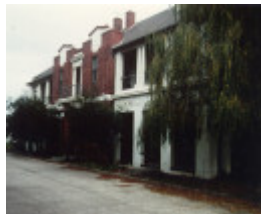
H01098 rafa barracks 1995