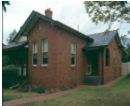
h01098 rafa barracks captain s quarters 2002