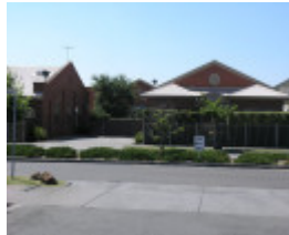
FORMER ROYAL AUSTRALIAN FIELD ARTILLERY BARRACKS SOHE 2008