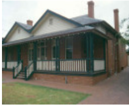
h01098 rafa barracks commandant s house 2002