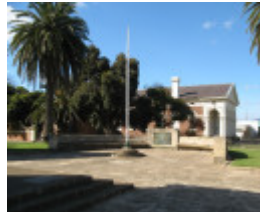
Ararat Civic Precinct Part of WWII Memorial