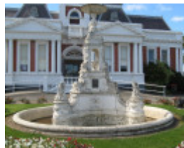
Ararat Civic Precinct Boer War Memorial Fountain