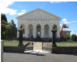
Ararat Shire Hall