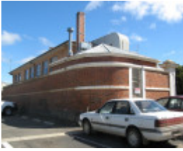
Ararat Civic Precinct Brick wall at rear of Shire Hall