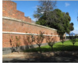
Ararat Civic Precinct brick wall at rear of Shire Hall