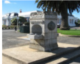
Ararat Civic Precinct King George V drinking fountain