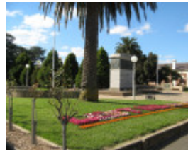
Ararat Civic Precinct