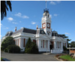
2011_Mar_2_ShireHall_Ararat (38) town hall