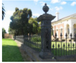
Ararat Civic Precinct iron fence around Shire Hall