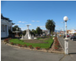
Ararat Civic Precinct Boer War Memorial lamp post and palms