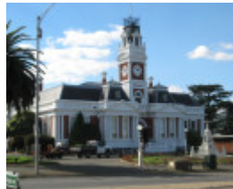
Ararat Civic Precinct town hall