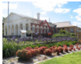
Ararat Shire Hall