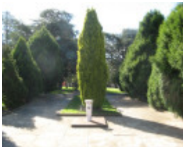
Ararat Civic Precinct landscpaing behind cenotaph