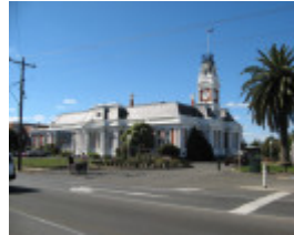
Ararat Town Hall