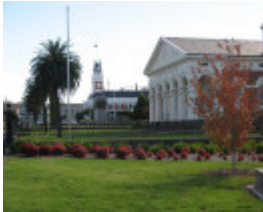
Ararat Civic Precinct