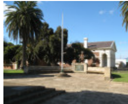
Ararat Civic Precinct Part of WWII Memorial