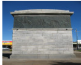
Ararat Civic Precinct Cenotaph