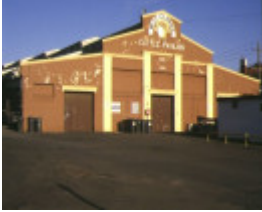
1 royal agricultural showgrounds epsom road ascot vale cattle pavillion