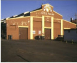
1 royal agricultural showgrounds epsom road ascot vale cattle pavillion