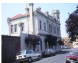
former north fitzroy post office st georges road fitzroy side view