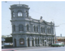
1 former north fitzroy port office st georges road fitzroy front corner elevation