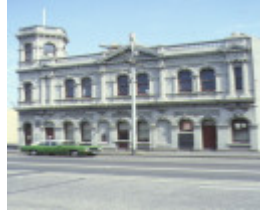
former north fitzroy port office st georges road fitzroy front elevation