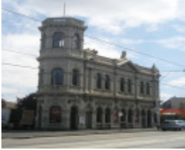
FORMER NORTH FITZROY POST OFFICE SOHE 2008