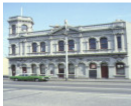
former north fitzroy port office st georges road fitzroy front elevation