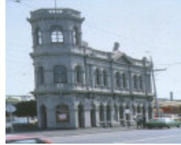
1 former north fitzroy port office st georges road fitzroy front corner elevation