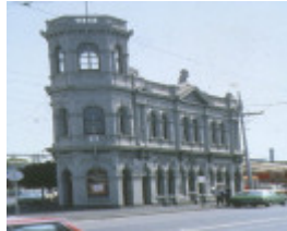
1 former north fitzroy port office st georges road fitzroy front corner elevation