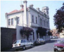
former north fitzroy post office st georges road fitzroy side view