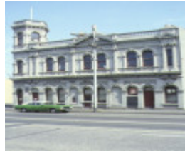
former north fitzroy port office st georges road fitzroy front elevation