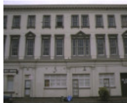
former eastern hill hotel victoria parade fitzroy front view