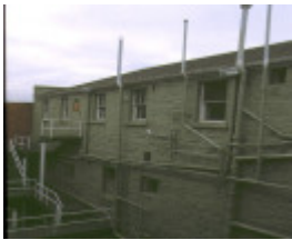
former eastern hill hotel victoria parade fitzroy rear view