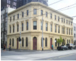
FORMER EASTERN HILL HOTEL SOHE 2008