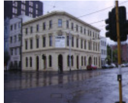
1 former eastern hill hotel victoria parade fitzroy corner view