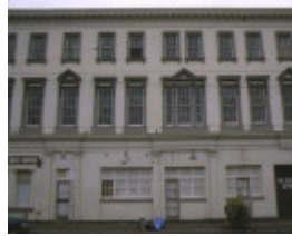
former eastern hill hotel victoria parade fitzroy front view