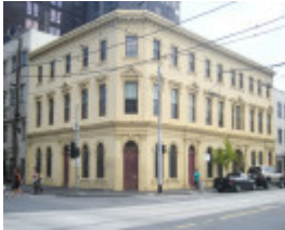
FORMER EASTERN HILL HOTEL SOHE 2008