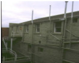
former eastern hill hotel victoria parade fitzroy rear view