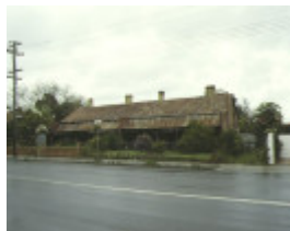
1 iron cottage brunswick road brunswick housing row 1992