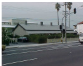
Iron Cottage 183 Brunswick Road Brunswick