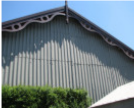
IRON COTTAGE SOHE 2008