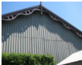
IRON COTTAGE SOHE 2008