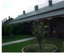
Iron Cottage 183 Brunswick Road Brunswick