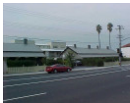
Iron Cottage 183 Brunswick Road Brunswick