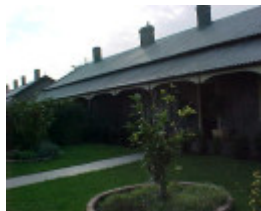
Iron Cottage 183 Brunswick Road Brunswick