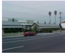
Iron Cottage 183 Brunswick Road Brunswick