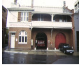
1 hawthorn fire station front view