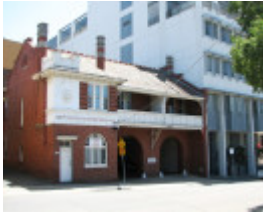
FORMER HAWTHORN FIRE STATION SOHE 2008