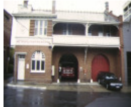
1 hawthorn fire station front view