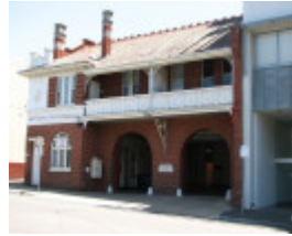
FORMER HAWTHORN FIRE STATION SOHE 2008