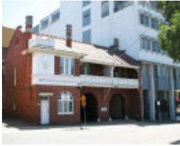
FORMER HAWTHORN FIRE STATION SOHE 2008