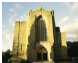
1 st monicas catholic church mount alexander road moonee ponds front elevation may1996