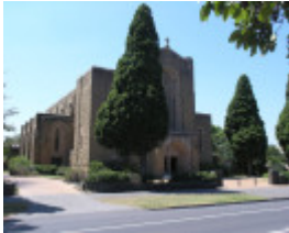
ST MONICAS CATHOLIC CHURCH SOHE 2008