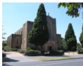
ST MONICAS CATHOLIC CHURCH SOHE 2008