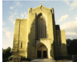
1 st monicas catholic church mount alexander road moonee ponds front elevation may1996