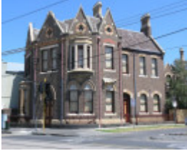
FORMER ES&A BANK SOHE 2008