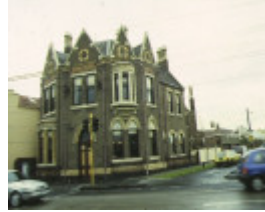
1 former es&a bank mount alexander road ascot vale front corner view aug1996