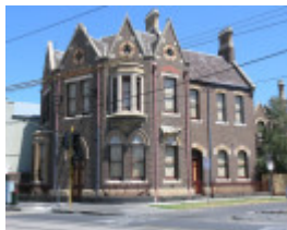
FORMER ES&A BANK SOHE 2008