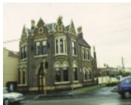
1 former es&a bank mount alexander road ascot vale front corner view aug1996