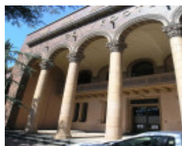
MARIBYRNONG TOWN HALL SOHE 2008