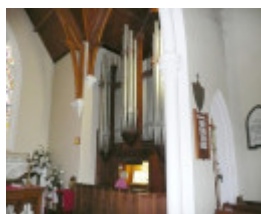
MARIBYRNONG TOWN HALL SOHE 2008