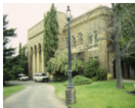
1 footscray town hall hall napier street footscray front view 1996