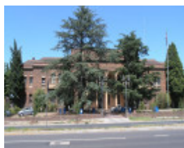
MARIBYRNONG TOWN HALL SOHE 2008