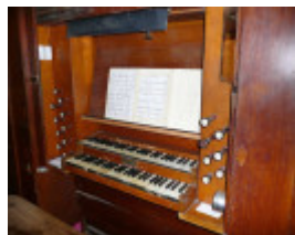
MARIBYRNONG TOWN HALL SOHE 2008