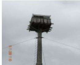
4932_Stringers_Knob_Fire_Sp 4932_Stringers_Knob_Fire_Sp 4932_Stringers_Knob_Fire_Sp