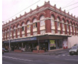
1 hoopers store sydney road brunswick front view