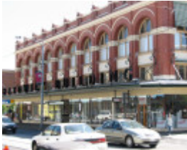
HOOPERS STORE SOHE 2008