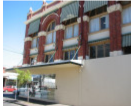
HOOPERS STORE SOHE 2008