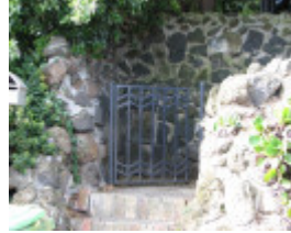
MURRAY GRIFFIN HOUSE SOHE 2008