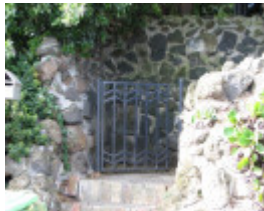
MURRAY GRIFFIN HOUSE SOHE 2008