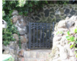
MURRAY GRIFFIN HOUSE SOHE 2008