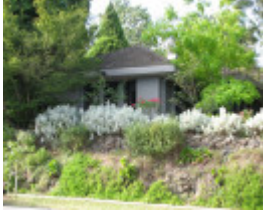
MURRAY GRIFFIN HOUSE SOHE 2008