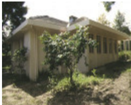
1 murray griffin house heidelberg side view dec1996