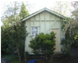
murray griffin house heidelberg East facade of shed