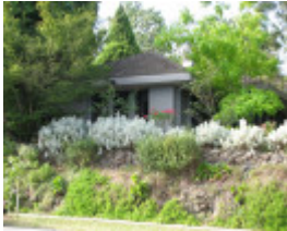
MURRAY GRIFFIN HOUSE SOHE 2008