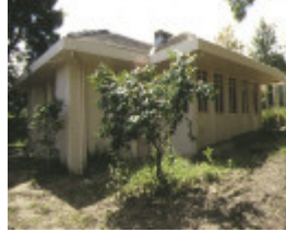
1 murray griffin house heidelberg side view dec1996