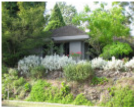
MURRAY GRIFFIN HOUSE SOHE 2008