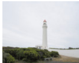
CAPE NELSON LIGHTSTATION SOHE 2008