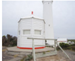
CAPE NELSON LIGHTSTATION SOHE 2008