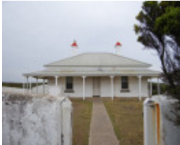
CAPE NELSON LIGHTSTATION SOHE 2008