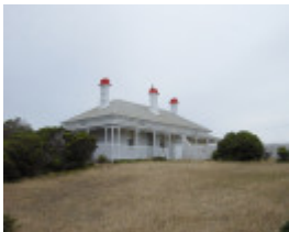
CAPE NELSON LIGHTSTATION SOHE 2008