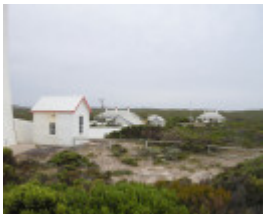
CAPE NELSON LIGHTSTATION SOHE 2008