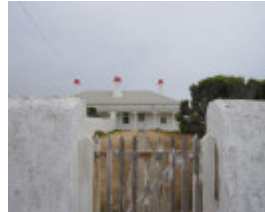
CAPE NELSON LIGHTSTATION SOHE 2008