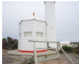
CAPE NELSON LIGHTSTATION SOHE 2008