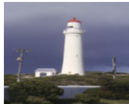
1 cape nelson lightstation portland lighthouse sep1998