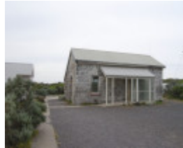
CAPE NELSON LIGHTSTATION SOHE 2008