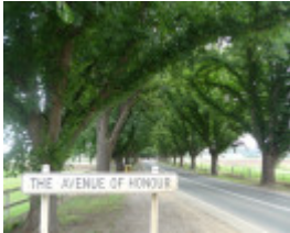
4957_Bacchus Marsh Avenue of Honour_25 December 2009_HV_019.JPG