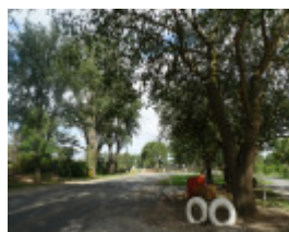
4957_Bacchus Marsh Avenue of Honour_25 December 2009_HV_048.JPG