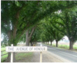
4957_Bacchus Marsh Avenue of Honour_25 December 2009_HV_019.JPG