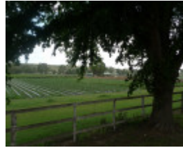
4957_Bacchus Marsh Avenue of Honour_25 December 2009_HV_020.JPG