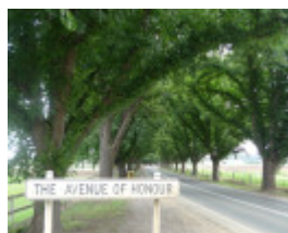
4957_Bacchus Marsh Avenue of Honour_25 December 2009_HV_019.JPG