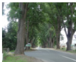
4957_Bacchus Marsh Avenue of Honour_25 December 2009_HV_039.JPG