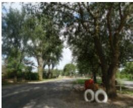
4957_Bacchus Marsh Avenue of Honour_25 December 2009_HV_048.JPG