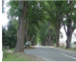
4957_Bacchus Marsh Avenue of Honour_25 December 2009_HV_039.JPG