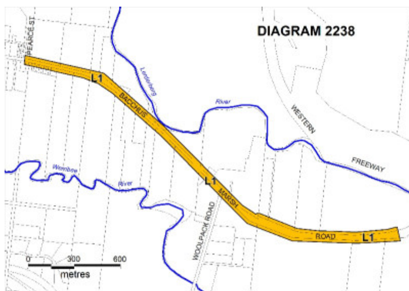
bacchus marsh aoh plan.jpg