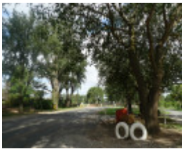
4957_Bacchus Marsh Avenue of Honour_25 December 2009_HV_048.JPG