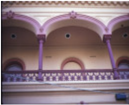
terrace 203 victoria parade fitzroy detail of balcony jul1984