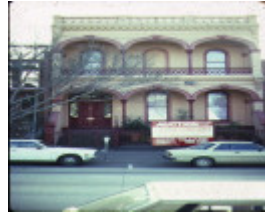
1 terrace 203 victoria parade fitzroy front view jul1984