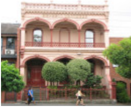
TERRACE SOHE 2008