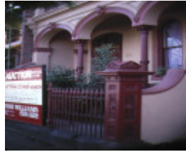
terrace 203 victoria parade fitzroy entrance gate jul1984