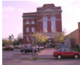
former north fitzroy electric railway substation brunswick street north fitzroy front view jun1995