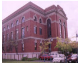
1 former north fitzroy electric railway substation brunswick street north fitzroy side elevation jun1995