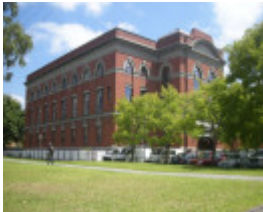
FORMER NORTH FITZROY ELECTRIC RAILWAY SUBSTATION SOHE 2008