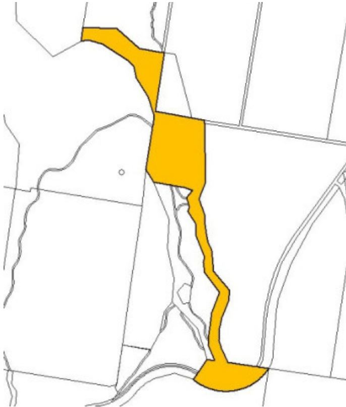
magpie creek historic reserve.jpg