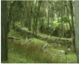
1 magpie creek gold mining diversion sluice magpie historic reserve beechworth slhy