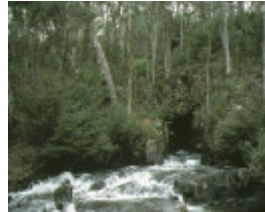
1 delegate river gold diversion tunnel bonang entrance view