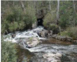
DELEGATE RIVER GOLD DIVERSION TUNNEL SOHE 2008