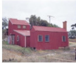
h01264 maldon state battery adair street maldon assay room battery she project 2003