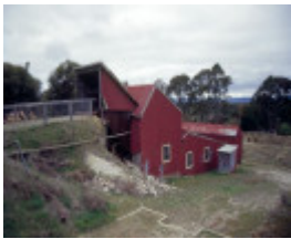
h01264 maldon state battery adair street maldon battery building she project 2003