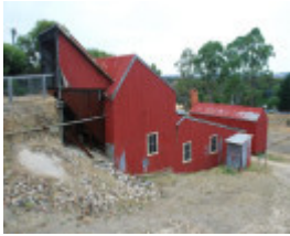
MALDON STATE BATTERY SOHE 2008