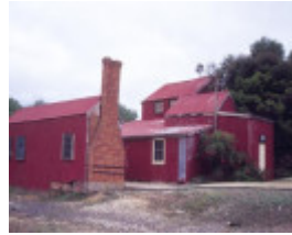
h01264 1 maldon state battery adair street maldon chimney assay room she project 2003