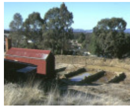
h01264 maldon state battery adair street maldon pits jul1994