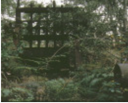
1 gambetta reef battery omeo old iron work