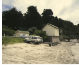
1 former jetty cargo shed flinders foreshore flinders view of sheds