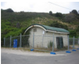
Former jetty cargo shed - view from south east, Jan 2008