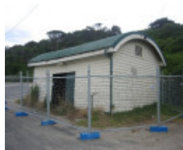
Former jetty cargo shed - view from north east, Jan 2008