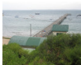
Jetty & shed - view from hill, Jan 2008