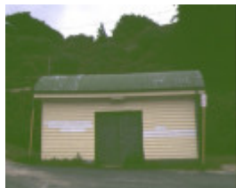
former jetty cargo shed flinders foreshore flinders front shed entrance