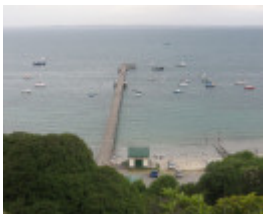
Jetty & surrounds - view from hill, Jan 2008