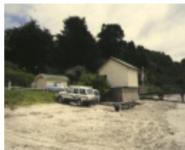
1 former jetty cargo shed flinders foreshore flinders view of sheds