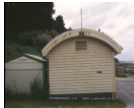
former jetty cargo shed flinders foreshore flinders rear shed side view