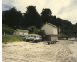
1 former jetty cargo shed flinders foreshore flinders view of sheds