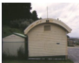
former jetty cargo shed flinders foreshore flinders rear shed side view