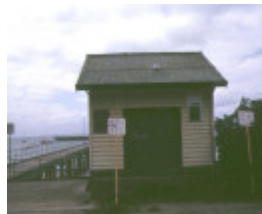
former jetty cargo shed flinders foreshore flinders entrance view