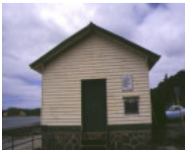
former jetty cargo shed flinders foreshore flinders front shed side view