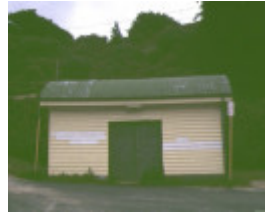
former jetty cargo shed flinders foreshore flinders front shed entrance