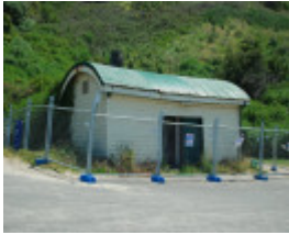
FORMER JETTY CARGO SHEDS SOHE 2008