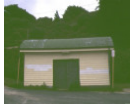
former jetty cargo shed flinders foreshore flinders front shed entrance