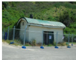
FORMER JETTY CARGO SHEDS SOHE 2008