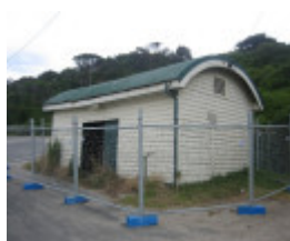
Former jetty cargo shed - view from north east, Jan 2008