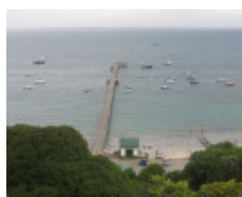
Jetty & surrounds - view from hill, Jan 2008