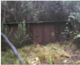
1 la mascotte treatment works side view