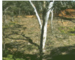
1 yackandandah creek hydraulic gold sluicing pit near beechworth cement workings