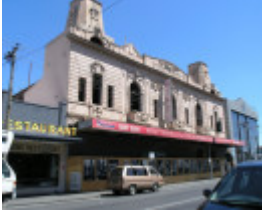
FORMER BARKLY THEATRE SOHE 2008