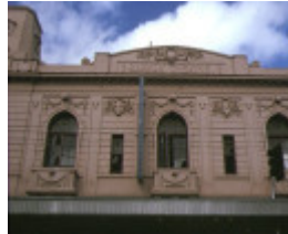
former barkley theatre barkly street footscray front windows aug1990