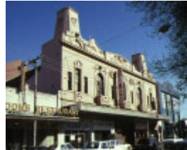
1 former barkley theatre barkly street footscray front view