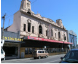
FORMER BARKLY THEATRE SOHE 2008