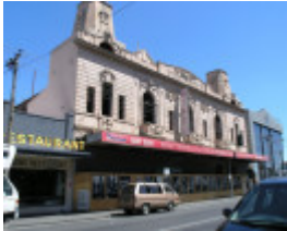
FORMER BARKLY THEATRE SOHE 2008