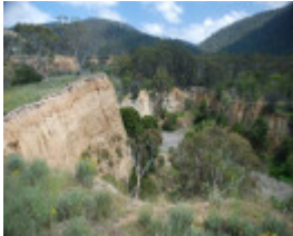
ORIENTAL CLAIMS HYDRAULIC SLUICING SITE SOHE 2008