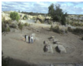
1 catherine reef united company gold mine eaglehawk aerial view may1993