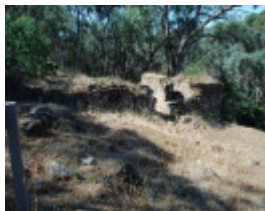
SPRING GULLY QUARTZ GOLD MINES SOHE 2008