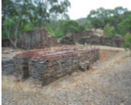
NORTH BRITISH GOLD MINE SOHE 2008