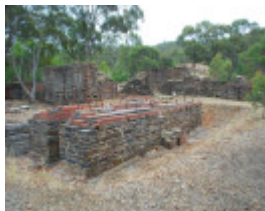
NORTH BRITISH GOLD MINE SOHE 2008