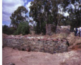
1 north british gold mine parkins reef road maldon side view dec1984