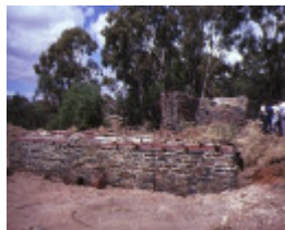
1 north british gold mine parkins reef road maldon side view dec1984