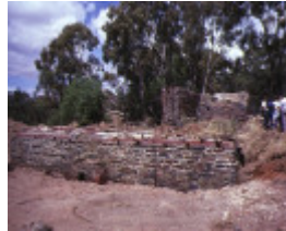
1 north british gold mine parkins reef road maldon side view dec1984