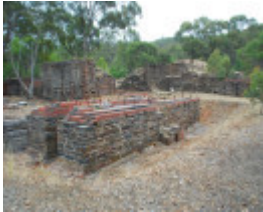
NORTH BRITISH GOLD MINE SOHE 2008