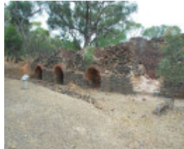
NORTH BRITISH GOLD MINE SOHE 2008