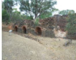
NORTH BRITISH GOLD MINE SOHE 2008