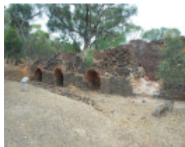
NORTH BRITISH GOLD MINE SOHE 2008