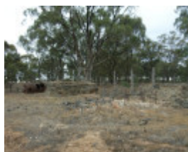
NINE MILE COMPANY GOLD MINE SOHE 2008