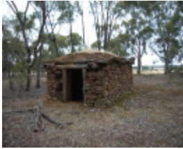
NINE MILE COMPANY GOLD MINE SOHE 2008