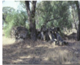
1 nine mile company gold mine wedderburn site view