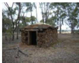
NINE MILE COMPANY GOLD MINE SOHE 2008