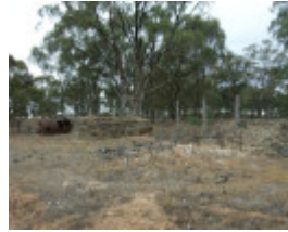
NINE MILE COMPANY GOLD MINE SOHE 2008