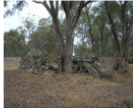
NINE MILE COMPANY GOLD MINE SOHE 2008