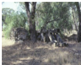
1 nine mile company gold mine wedderburn site view