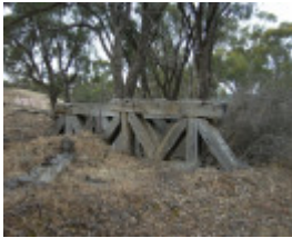
NINE MILE COMPANY GOLD MINE SOHE 2008