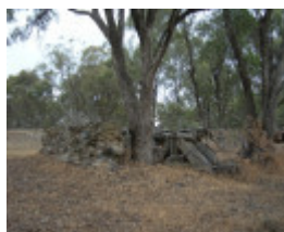
NINE MILE COMPANY GOLD MINE SOHE 2008