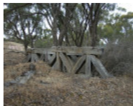
NINE MILE COMPANY GOLD MINE SOHE 2008