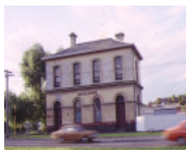
h00494 ercildoune napier street footscray front view