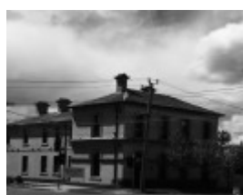
ERCILDOUNE October 2016