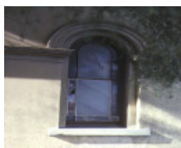
ercildoune napier street footscray detail window