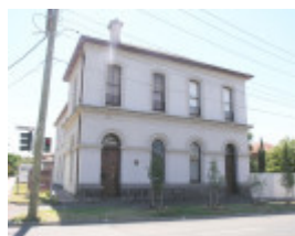
ERCILDOUNE SOHE 2008