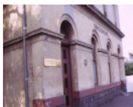
ercildoune napier street footscray front entrance