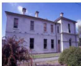
ercildoune napier street footscray west elevation she project 2003