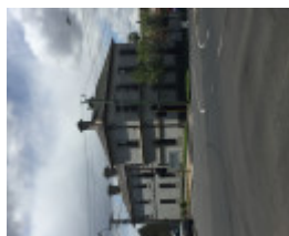
ERCILDOUNE October 2016