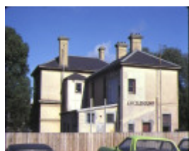
ercildoune napier street footscray rear view