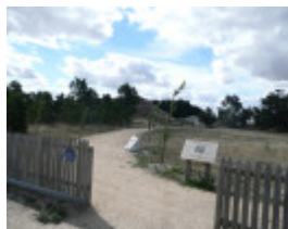
NEW AUSTRALASIAN NO. 2 DEEP LEAD GOLD MINING MEMORIAL AND SITE SOHE 2008