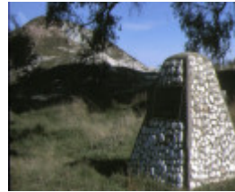
1 new australasian no 2 deep lead gold mine moores road creswick memorial