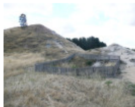
NEW AUSTRALASIAN NO. 2 DEEP LEAD GOLD MINING MEMORIAL AND SITE SOHE 2008