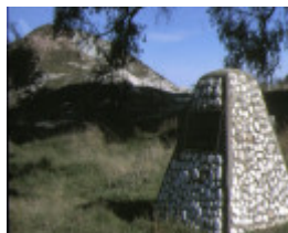
1 new australasian no 2 deep lead gold mine moores road creswick memorial