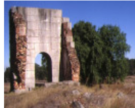
1 duke & timor deep lead gold mine timor pumping engine building rear view mar1998