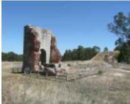
DUKE AND TIMOR DEEP LEAD GOLD MINE SOHE 2008