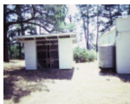
former franklinford common school rear view jan1985