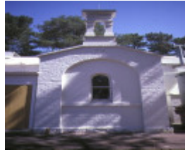
former franklindford common school entrance jan1985