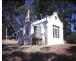
1 former franklindford common school front view jun1985