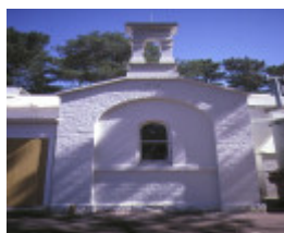
former franklinford common school entrance jan1985