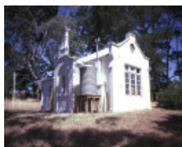
1 former franklinford common school front view jun1985