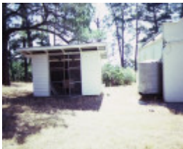
former franklindford common school rear view jan1985