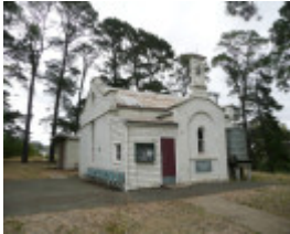
FORMER FRANKLINFORD COMMON SCHOOL SOHE 2008