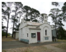
FORMER FRANKLINFORD COMMON SCHOOL SOHE 2008