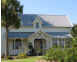
BALLAM PARK SOHE 2008