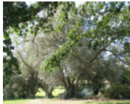
BALLAM PARK SOHE 2008