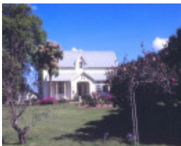
ballam park cranbourne road frankston front she project 2003