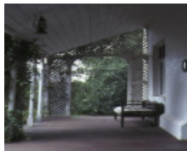
ballam park frankston front porch mar1984