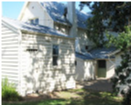
BALLAM PARK SOHE 2008