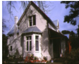
1 ballam park frankston front view