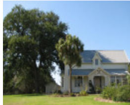
BALLAM PARK SOHE 2008