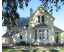
BALLAM PARK SOHE 2008