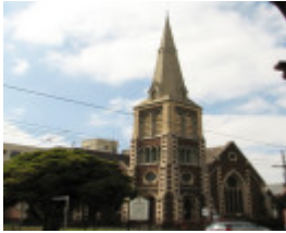
FORMER PRESBYTERIAN CHURCH BUILDINGS SOHO 2008