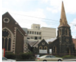
FORMER PRESBYTERIAN CHURCH BUILDINGS SOHO 2008