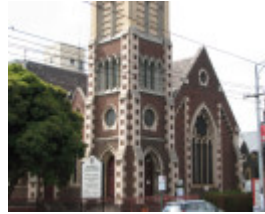
FORMER PRESBYTERIAN CHURCH BUILDINGS SOHO 2008