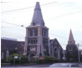
1 former presbyterian church buildings sydney road brunswick front view