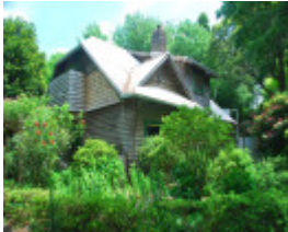
LONGACRES SOHE 2008