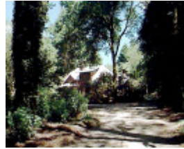
1 streeton residence olinda dec1999 dw