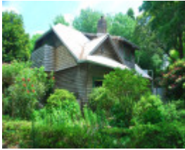
LONGACRES SOHE 2008