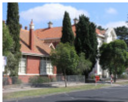
FORMER ESSENDON HIGH SCHOOL SOHE 2008