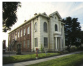
1 former essendon high school buckley street essendon front entrance oct1996