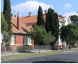
FORMER ESSENDON HIGH SCHOOL SOHE 2008