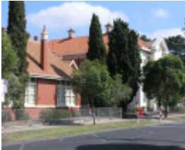
FORMER ESSENDON HIGH SCHOOL SOHE 2008