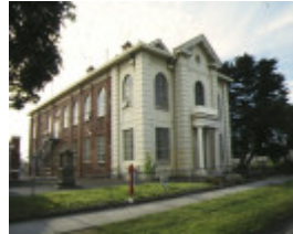
1 former essendon high school buckley street essendon front entrance oct1996