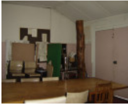
H1343 Interior of kitchen extension. Dec 2006.