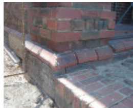
H1343 Existing condition - Exterior, south-east corner, dislodged brickwork and missing mortar. Dec 2006.