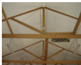
H1343 Interior - roof truss at east end of hall with missing strut. Dec 2006.