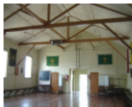
H1343 Interior - general view looking east. Dec 2006.