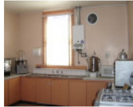
H1343 Interior of kitchen extension - general view. Dec 2006.