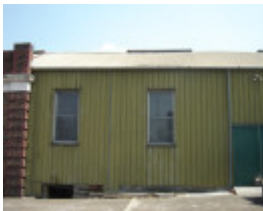
H1343 Exterior - North facade, note sagging roof sheeting. Dec 2006.