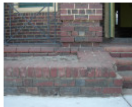
H1343 Exterior - East (front) facade, dislodged brickwork and missing mortar. Dec 2006.