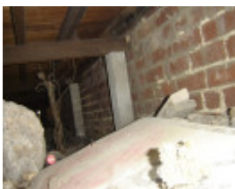
H1343 Subfloor, at shed hall to brick front junction. Dec 2006.