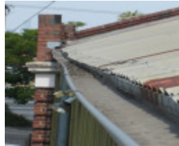
H1343 Existing condition - Eaves gutter north side. Dec 2006.