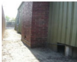
H1343 Exterior - South facade, with raised ground level. Dec 2006.