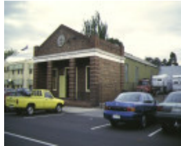
1 first footscray scout hall hyde street footscray front view apr1997