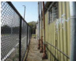
H1343 Exterior - West facade, with raised ground level. Dec. 2006.