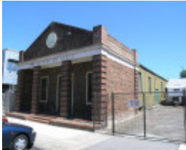
KARIWARA DISTRICT SCOUT HEADQUARTERS SOHE 2008