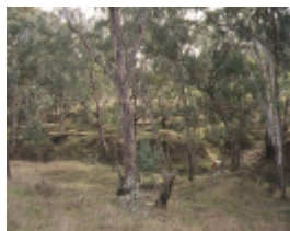
1 new nuggetty gully alluvial gold workings yandoit creek werona road yandoti earth works