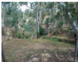
NEW NUGGETTY GULLY ALLUVIAL GOLD WORKINGS SOHE 2008