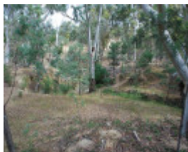
NEW NUGGETTY GULLY ALLUVIAL GOLD WORKINGS SOHE 2008