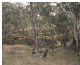
1 new nuggetty gully alluvial gold workings yandoit creek werona road yandoti earth works