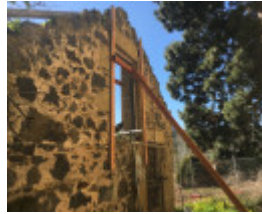
2019 stable ruins