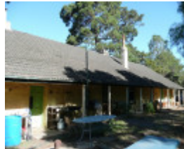
OLD SWAN INN SOHE 2008