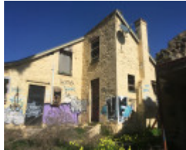
2019 Inn building