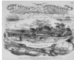
1860 Samuel Calvert