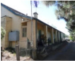
OLD SWAN INN SOHE 2008