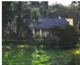
h00267 old swan inn fyansford