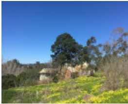
2019 outbuildings and Inn viewed from the north