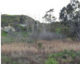
2019 View of the Swan Inn from across the River