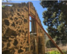
2019 stable ruins