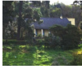
h00267 old swan inn fyansford