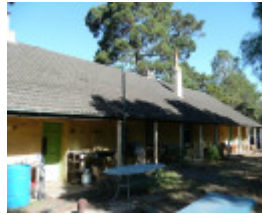
OLD SWAN INN SOHE 2008