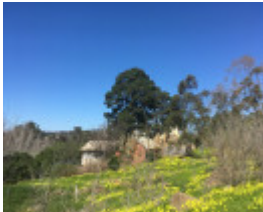
2019 outbuildings and Inn viewed from the north