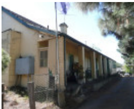
OLD SWAN INN SOHE 2008