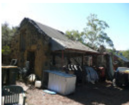
OLD SWAN INN SOHE 2008