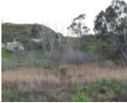
2019 View of the Swan Inn from across the River