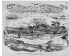
1860 Samuel Calvert